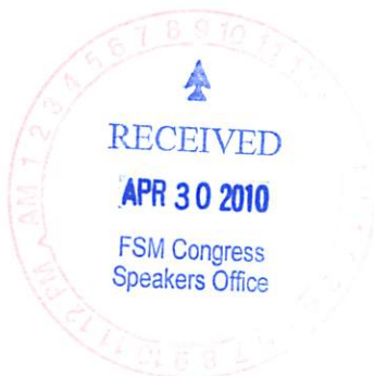
Isaac V. Figir Speaker Congress of the Federated States of Micronesia

A handwritten signature in black ink, appearing to read "Liwiana K. Ramon".